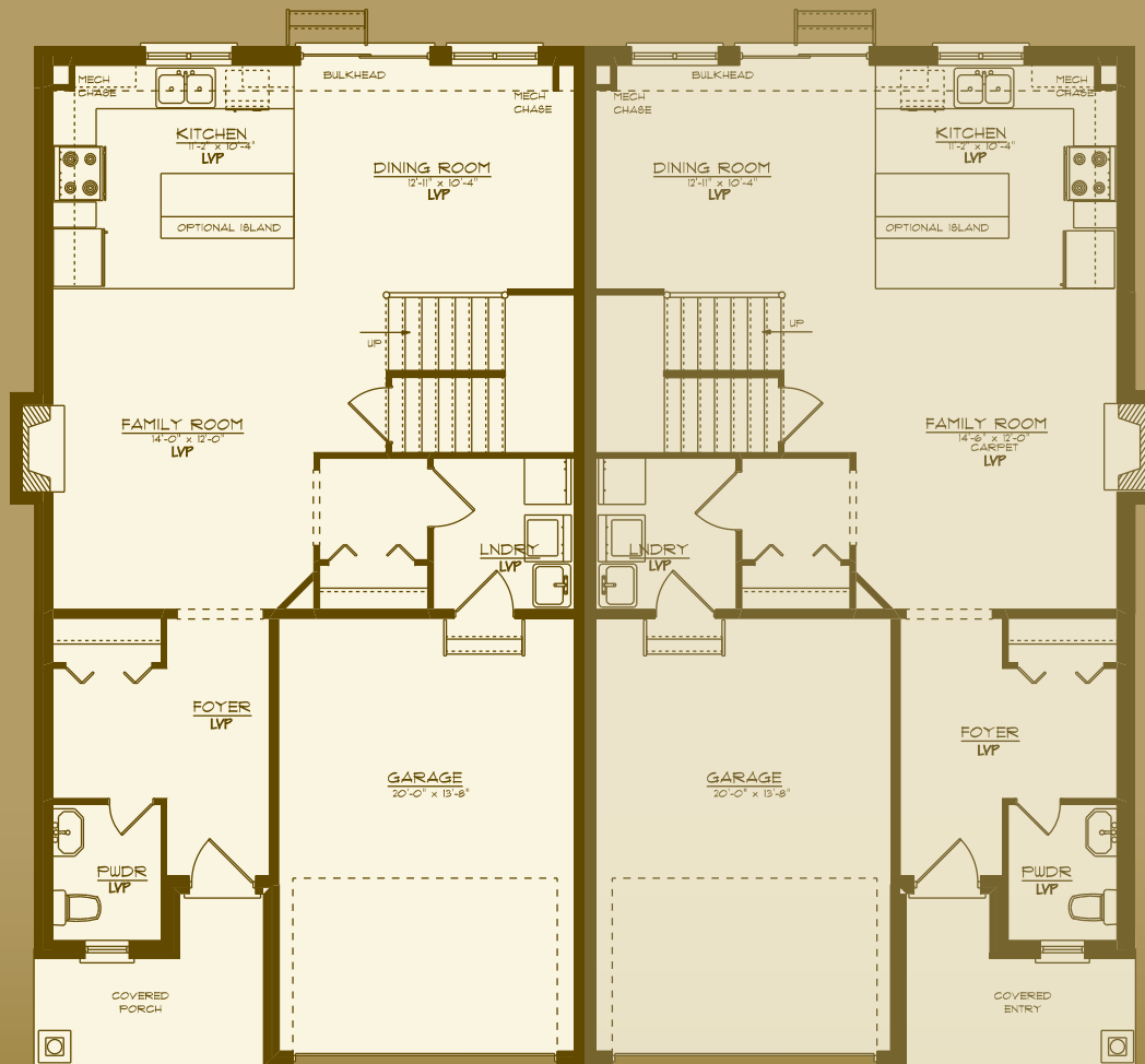
MacPhail Main Floor 854 Sq. Ft.

Square Footage: 1,905 Bedrooms: 4 Bathrooms: 2.5 Storeys: 2 Lot Width: 51 ft.